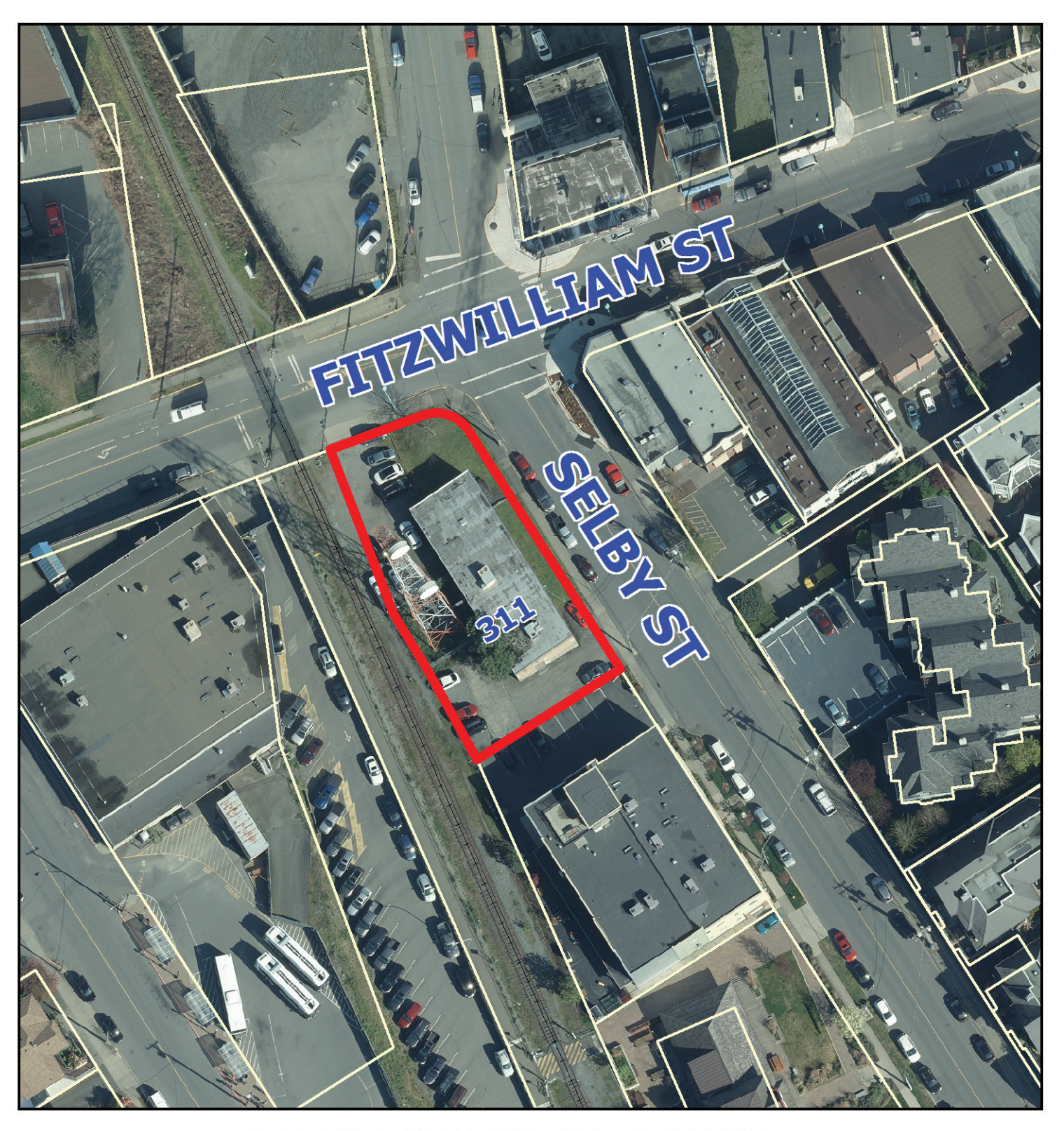
REZONING APPLICATION NO. RA000387