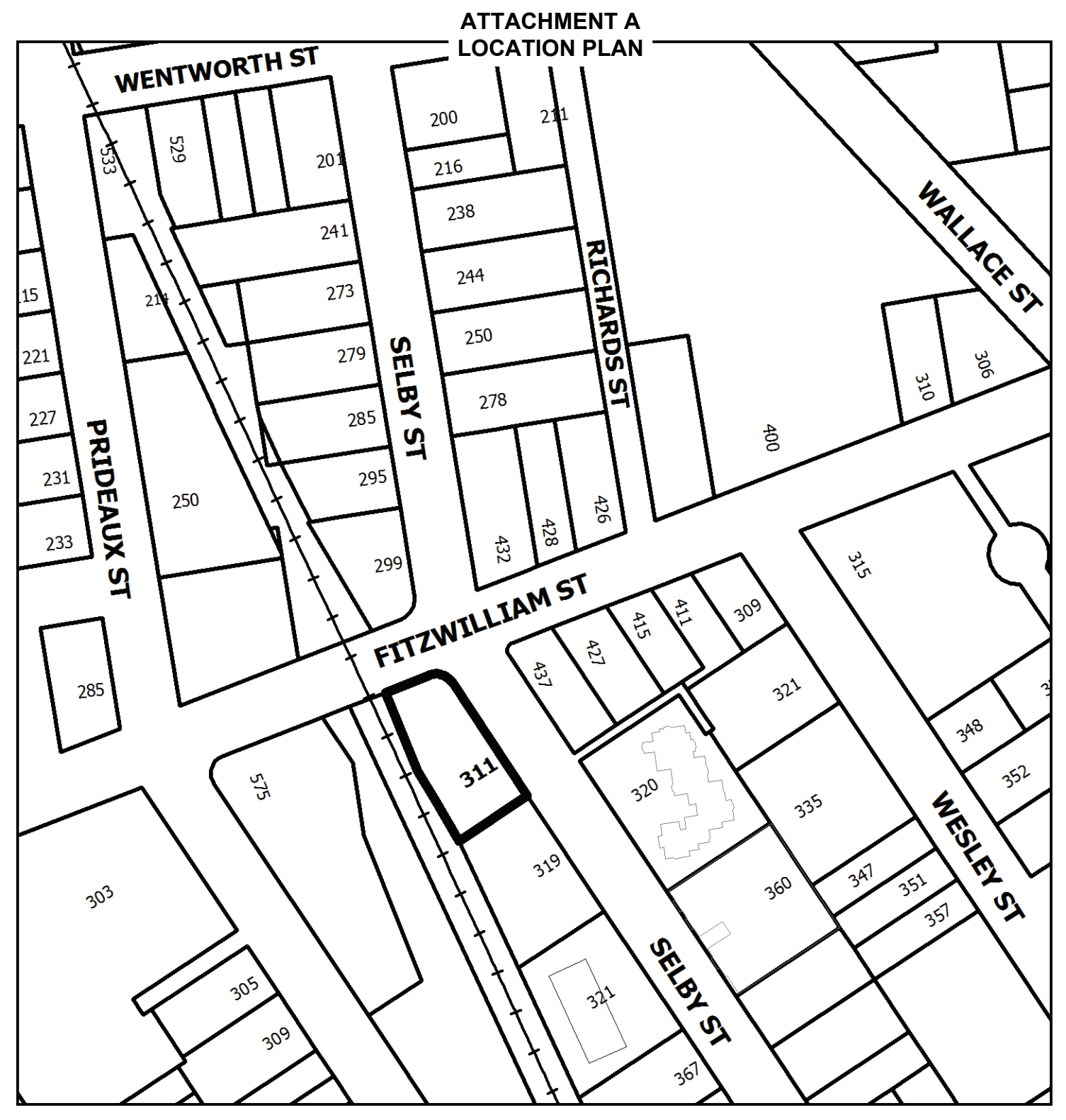
REZONING APPLICATION NO. RA000387